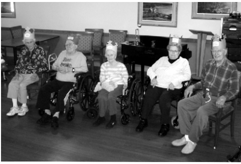
The April Birthday Clan.

We also have a Clearance Room at 75% off, come and see what we have to offer!