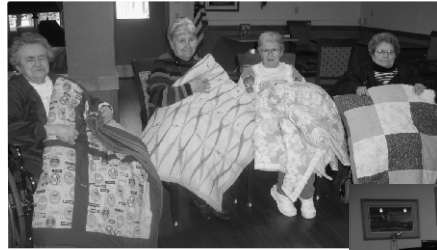
A Special thanks to the Elk Creek Sew Sews for the quilts.