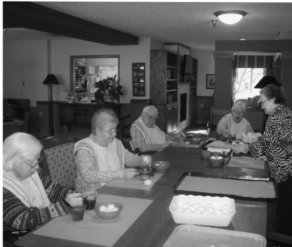
The ladies and gentlemen coloring Easter eggs

The 2012 Easter Season was a busy one. This year we started out by making bird nest treats out of coconut and M & M's. We also spent time coloring Easter eggs for all our of residents and staff to have during their Easter meal. The residents had an Easter egg hunt on Saturday and woke up on Sunday with a special treat! We want to thank all of the family members who came in and visited with their loved ones during this holiday season. Another special thank you goes out to the kids who grew and donated the Easter lilies for our residents to enjoy!