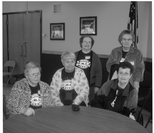
Our Greenseth Team who took 3rd in Mondovi