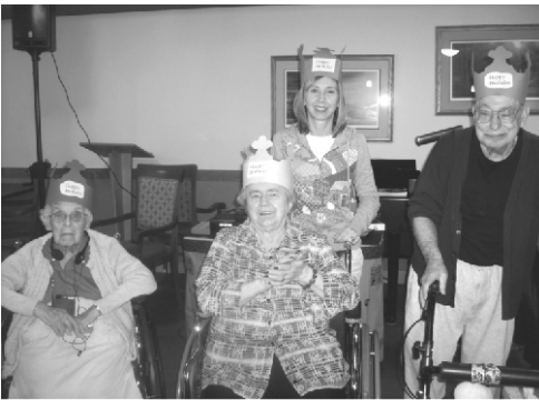
Our March Birthdays!