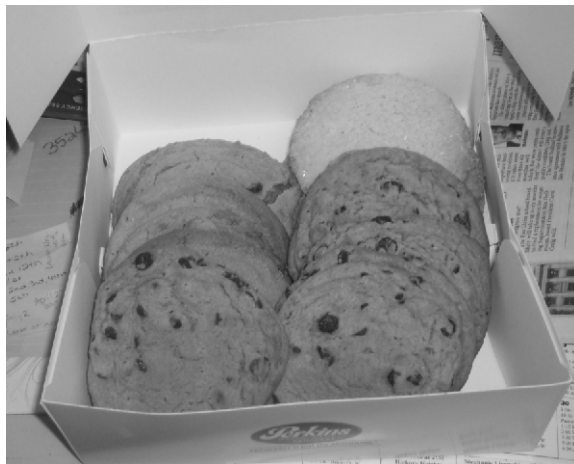
The cookies that the Perkin's in Black River donated to us!